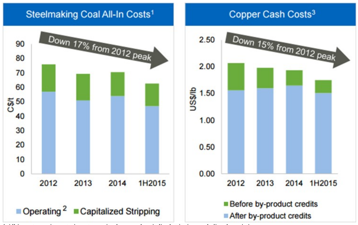
Exhibit 5 Teck Resources: Costs for Steelmaking Coal and Copper; 2012-Present

Despite these lower prices, the quality of Teck's resources and its ability to manage costs have allowed it to maintain profitability. As shown in Exhibit 5, the company's all-in costs for steelmaking coal, which includes site costs, inventory write-downs and capitalized stripping, have been reduced to approximately CAD60 per tonne. Including transportation, the combined costs for coal were CAD92 per tonne in 2014.